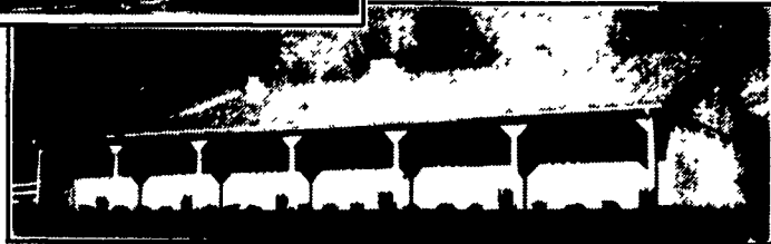
HORSE STALL BARN