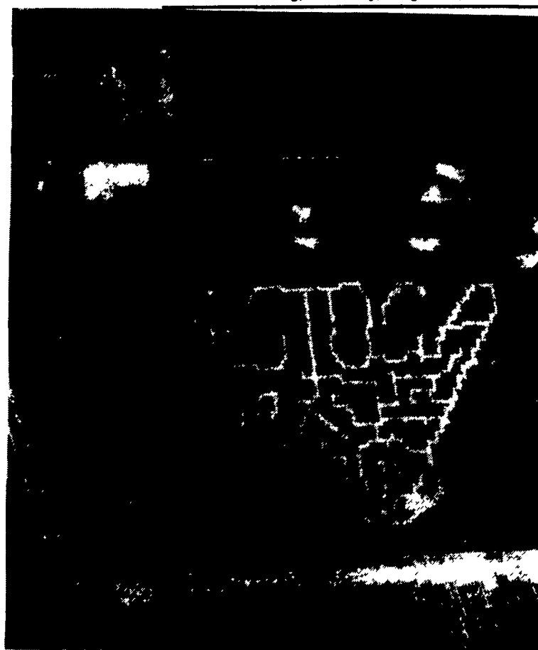
A view of the Conestoga Corn Maze located just east of Conestoga Mennonite Church, one mile west of Morgantown along Route 23.

A refreshment stand and children's activities will also be available most days with additional special events on some days. Enjoy the challenge of exploring Conestoga's Corn Maze.