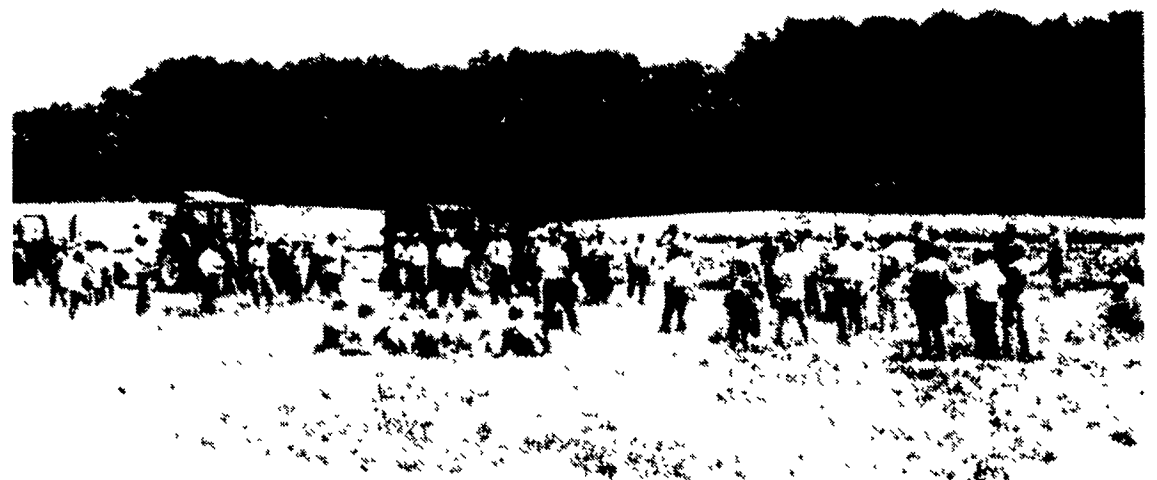
Part of the crowd of more than 200 farmers and agribusiness people assemble for field demonstrations.