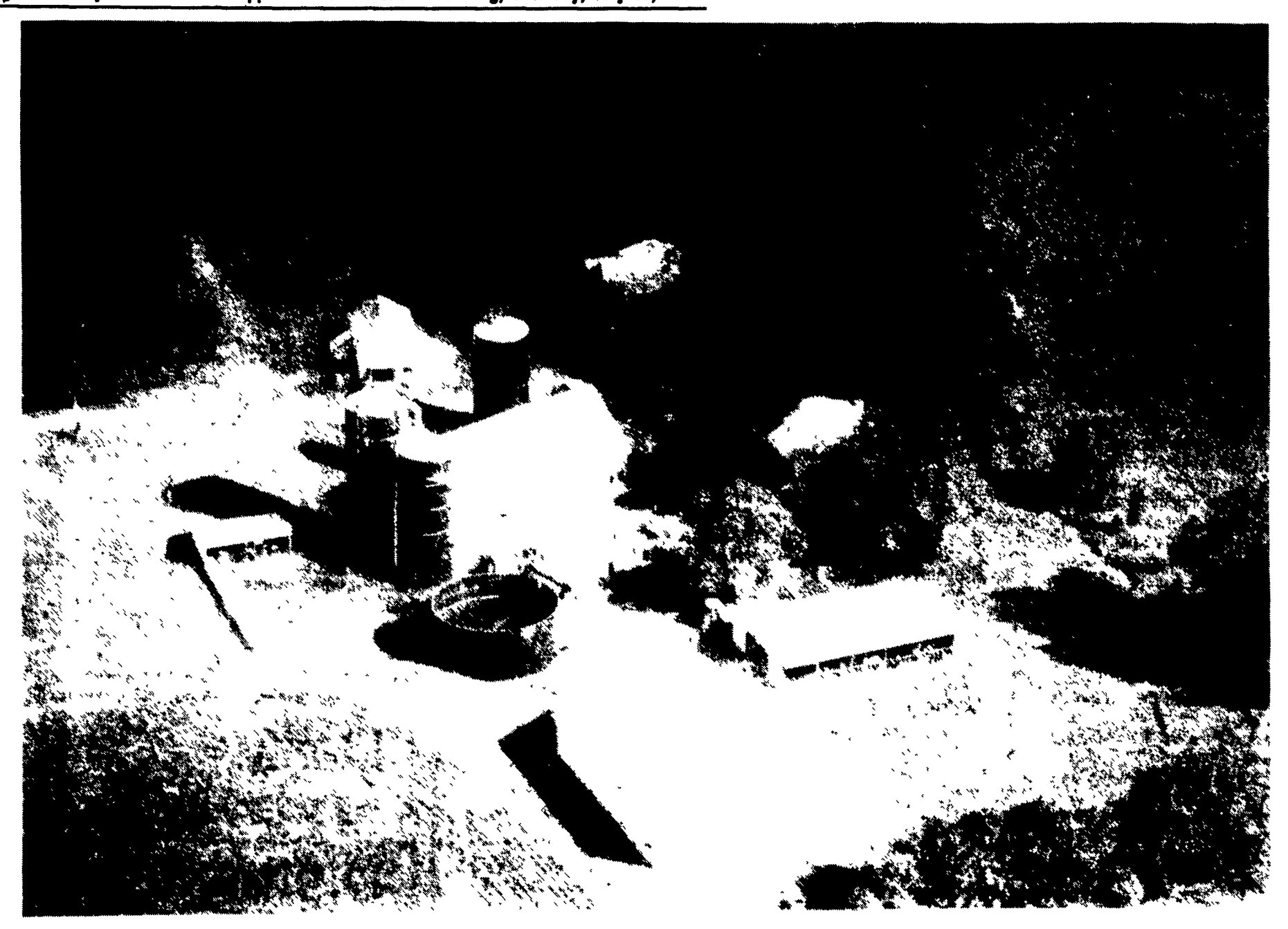
An aerial view of Willow Springs Farm.