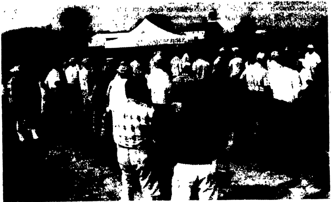
A large group of farmers, dealers, applicators, and extension agents attended the Novartis and FMC New Holland Summer Tour and Picnic on Tuesday.

Specifically, the tour group was able to evaluate burcumber control options in both corn and soybeans; participate in how to control tough weeds with tillage and herbicide