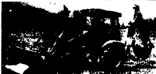
Case 580K 4x4, Ext -A-Hoe, New Paint, Nice Condition.....$26,900