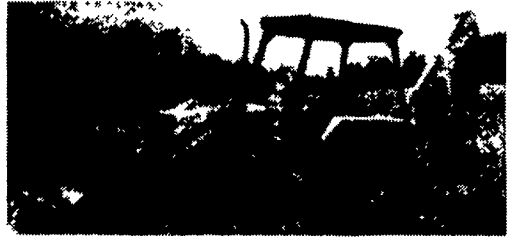
JCB 1400B, 86 & 87 Model, 2 to Choose From.....Starting at $13,900 Ford 555B 4x4 Ext-A-Hoe, 88 model, New Overhaul.....$21,800