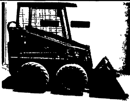
Case 1835B Diesel Skid-Loader $6,300