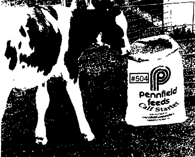
#504 Go-Calf Starter Flakes

OPEN 6 DAYS PER WEEK FOR YOUR CONVENIENCE