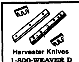
Harvester Knives 1-800-WEAVER D