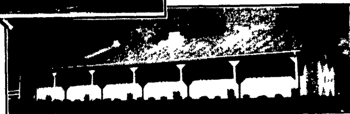
HORSE STALL BARN