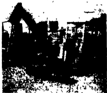
Vermeer M-470 Trencher with backhoe. This is one of six units we have all ready to work. Starting at $4,500.

Huntingdon Valley, PA • 215-672-9667 • 1-800-543-3833 • Eddie