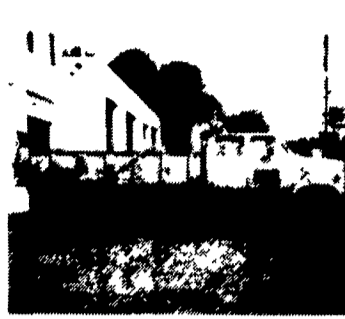
1986 Chevy 5 Man Cab Dump, 3208 Cat - 5/2, Air Brakes. Dump with Lift Gate. Dump 14' Long, GVW 34,000 pounds.