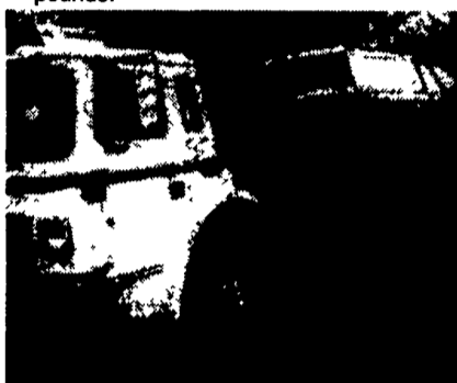
Roll Back - 1982 International with DT-466 Diesel - 5 Speed Auto. GVW 43,000 lbs - Former Utility Company Truck Only 13,877 Miles, 26' Bed.