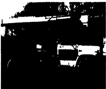
Material Handler Bucket Truck - 42 Bucket with Jib 1981 and 1982 Diesel Engine - Auto or Stick - Spring Special $9,995