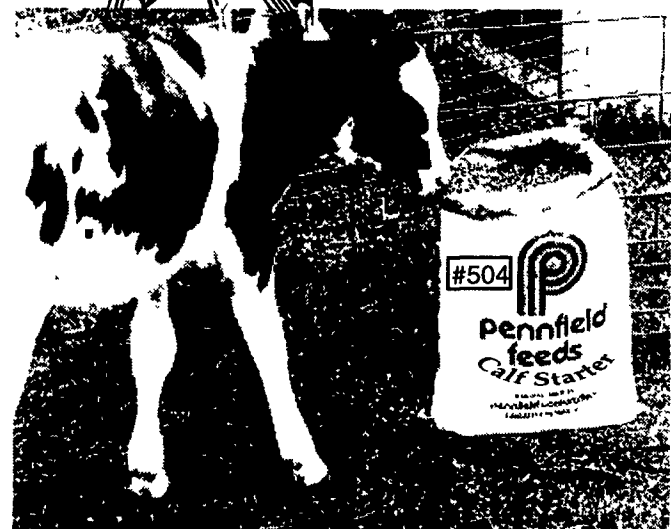
#504 Go-Calf Starter Flakes

#50409F GO-CALF 17% Starter 50 LB. BAGS $7.86