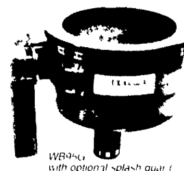
WB94G with optional splash guard