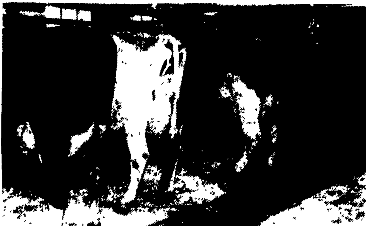
The four-year-old class at Spruce-Edge Farm.