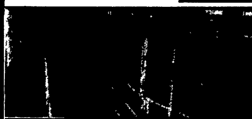
INTERIOR OF PARLOR