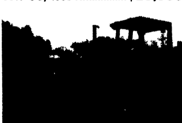
1985 Case 455C with 950 Hr., Extra Clean.....$19,500