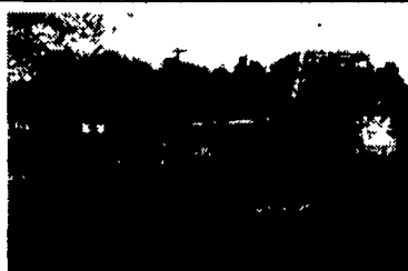
1985 JD 655 Crawler Loader with 90% UC, 4900 Hr.....$28,500