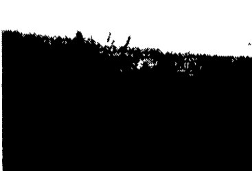
Galion Roller w/Tow Package.....$3,900