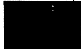
GSI lift, 3'x6' platform, 24' working height, elec. power.....$3,200