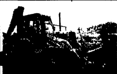
1988 Cat 416, full cab, ext-a-hoe, new paint, good rubber.....$20,500