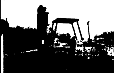
Case 586E forklift 6000 4x4 new paint 2800 hrs.....$24,500