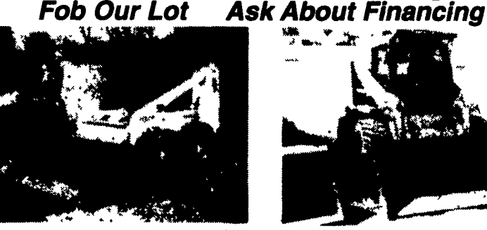
UT 3584 Bobcat 843 Diesel 54 HP 1983 Model, Serviced Ready to