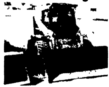
UT 3324 Gehl 60 HP Model 6620 Diesel 1986 with New 72" Wide