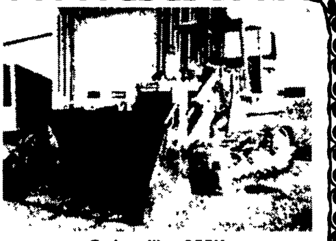
Caterpillar 955K crawler loader 4-1 bucket

(717) 469-0039 (800) 446-0505 FAX (717) 469-7679