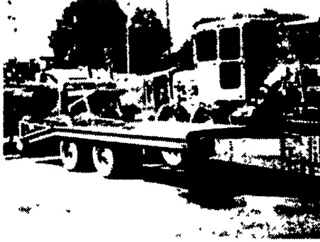
Do Mor 15 ton electric brake tandem axle dual wheel trailer: 13 ft deck/5 ft Beaver 7.50x15 tires $2,000