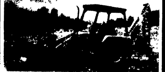
JCB 1400B, 88 Model, 2 to Choose From..... $14,700 Ford 555B 4x4 Ext-A-Hoe, 88 model, Low Hrs..... $23,500

Jay Weaver Financing & Lease Purchase Available 717/336-7375 NO SUNDAY CALLS