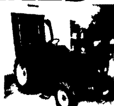
3320 46 HP 2WD w/Loader