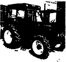
6340.2 70 HP 4WD w/cab