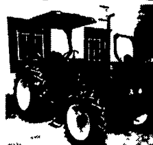
6340.0 70 HP 4WD w/canopy