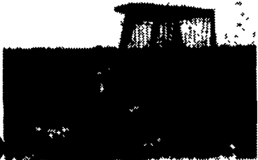
Case 1835B, Skid Loader Good Cond. $7,700

391 N. Farmersville Rd., Ephrata, PA 17522 (Just minutes off RT 222) (717) 859-3283