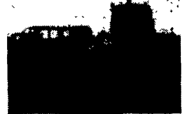
Flat Allis 545B, 3 Yd. Bucket $16,500