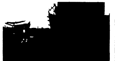
NH 1008 Stack Wagon, Excellent Condition $2,500