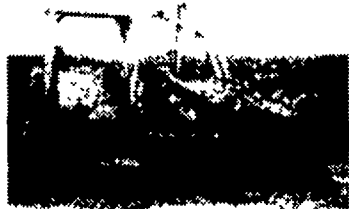
Cat 951C $17,500