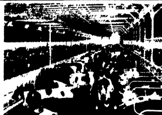
Free Stall Barn Interior