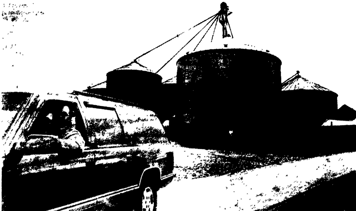
Carl Shaffer has 200,000 bushel capacity in grain bins some of which is rented out to store wheat for a local flour mill.

"We live in a changing world with a global market. If we don't continue to develop practical technology that farmers can use, we will be left behind. If we can find a better way to farm without harming the environment, that's wonderful."