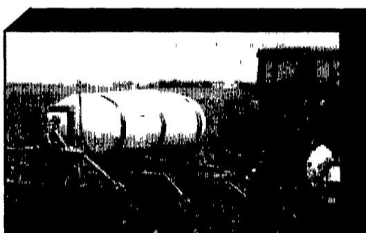
750 Gallon Or 1,000 Gallon Pull-Type w/Heavy Duty Tandem Or Single Axle, 45' Or 60' Boom