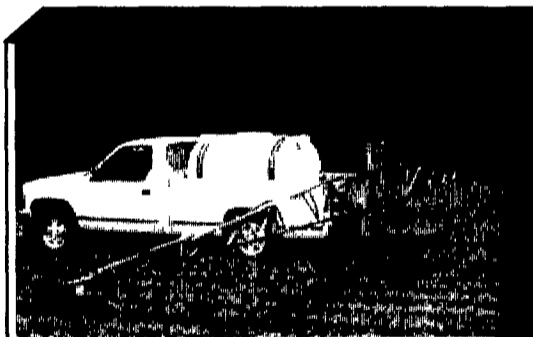
Skid Sprayer, 400 Gallon & 500 Gallon Capacity