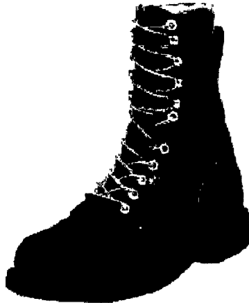
9 inch style 846

NEW HEAVY DUTY SHOE This deluxe shoe features tough long lasting HORSEHIDE LEATHER and features a rugged Marathon sole. Horsehide is the most durable, acid resistant, leather we know of. Excellent for farm use, construction use or any purpose where rugged and long wear is desired. This shoe features a one piece sole and heel construction, Genuine Goodyear welt and storm welt. Extra stitching at stress points, thick, soft padded collars made of leather, Permafresh cushion insoles and arch supports. Hooks and eyes. Steel shank. Oil resistant soles. Shoes are generously sized. Top Quality American Construction.