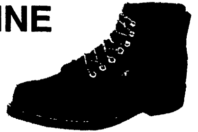
6 inch style 344