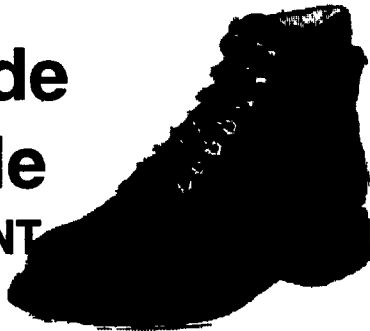
6 inch style 346