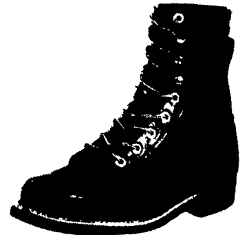
8 inch style 844

Made of rugged American horsehide leather. Horsehide is more resistant to barnyard acids, silage acids, milk, fertilizer, concrete, oil and grease. These shoes have a nitro cork sole which gives good traction on concrete floors but will not track mud or manure. These shoes have replaceable heel and sole, deluxe cushion insole and arch support, steel shank leather welt, padded collar and are brown in color. Ideal for barnyard use. American Made.