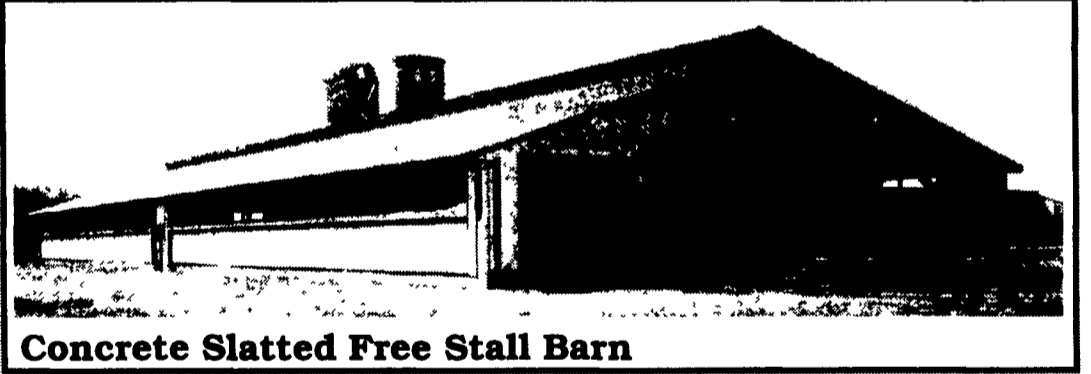
Concrete Slatted Free Stall Barn