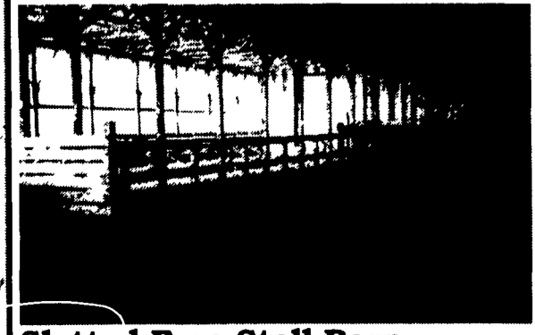
Slatted Free Stall Barn