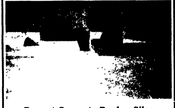
Precast Concrete Bunker Silos