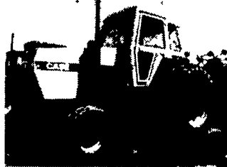
Case 2090 (#11908) 4223 Hours, $10,900