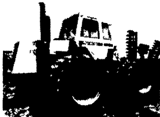
Case 2670 (#95559) 6672 Hrs., Runs Great $11,900