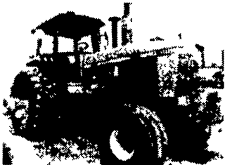
JD 4840 (#14105) 2WD, 6450 Hrs., Rebuilt Trans. '96 $27,000