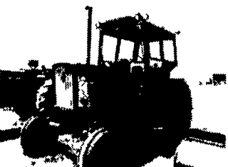
Farmall 706 (#13545) 4500 Hrs., Diesel $6,800