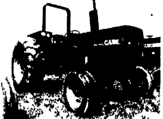
Case-IH 885 (#12394) 2WD 2900 Hours $13,900