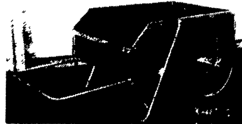
Photo is 15 Cu. Ft. Size