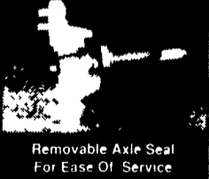
Removable Axle Seal For Ease Of Service