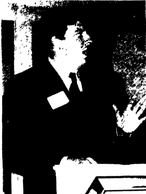
State Sen. Dan Delp, chairman of the Senate Agricultural and Rural Affairs Committee, presents the Senate proclamation for State Grange Week and Day, and also discusses some of the achievements and changes in the state's agricultural policies.