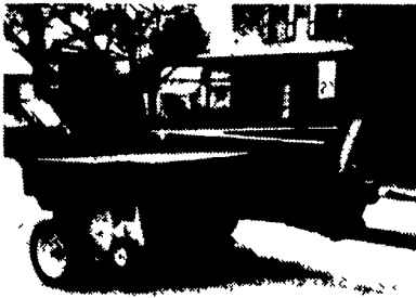
NH 310, Super Sweep, #70 Thrower w/warranty $3,450