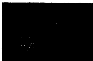
JD 4230 4 Post $10,900

Shaver Post Drivers Complete HD 10 - $1,895 HD 8 - $1,195