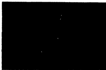
Hough Payloader, 4x4 Gas, Runs Excellent $4,900

2325 Feeser Road 410-751-1500 Bush Hog® King Kutter