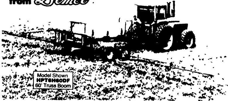
Model Shown HPT600DF 60' Truss Boom