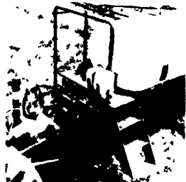
Large front mounted step, platform and safety rail for easy filling of the tank. Clean water tank is standard.