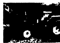
Ford 1920 4WD w/Loader, 2 to choose from