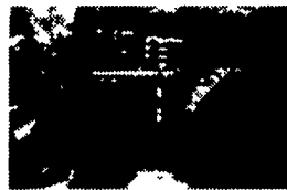
Kubota L3600 4x4 w/Loader, 250 Hrs.

Large Selection of Used Tractors In Stock