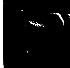
JD 855 4x4 Hydro, w/Loader Only 190 Hrs. Ex. Condition