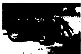
Kubota L2250 4WD TLB, 700 Hrs, Good Cond.