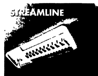
Seamless Drinkerline with Superior Emitter Technology

Netafim Drinkerlines provide row crop growers superior performing products compared to standard drip tapes. Netafim's Streamline®, Typhoon® and Python® thin wall drinkerlines consistently operate with the lowest flow variation in the industry. Every emitter delivers the same amount of water and nutrients to ensure uniform crop growth and higher yields.