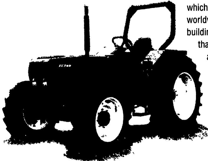
Model 7340.0 87HP/4WD Suggested List $27,608.00

And all Zetor tractors come with a two year warranty which underscores its worldwide reputation for building quality tractors that last, and more and more farmers are quick to agree.