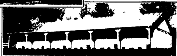
HORSE STALL BARN