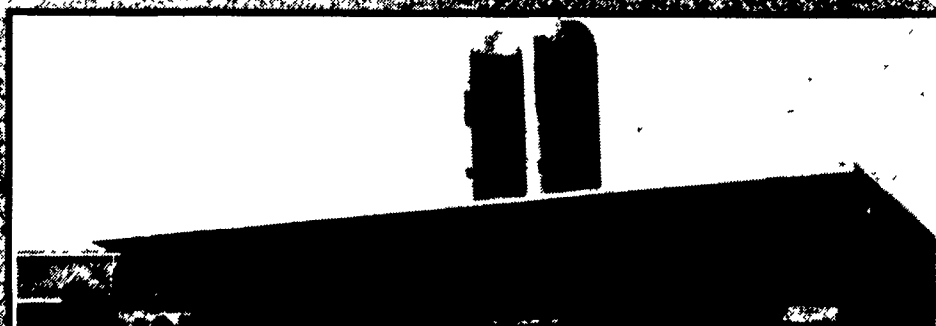
Slatted Heifer Barn