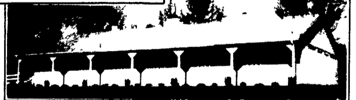
HORSE STALL BARN