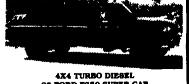
4X4 TURBO DIESEL 93 FORD F250 SUPER CAB A Real Towing Machine, 7.3 Turbo Diesel, 5 Spd O/D, A/C, Tow Pkg. Hitch, 60,000 Miles