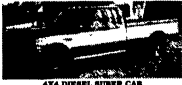
4X4 DIESEL SUPER CAB 90 FORD F250 XLT This One is Nice, 7.3 Diesel, AT, A/C, 65,000 Miles, You Gotta See This One