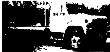
85 I.H. CHASSIS Diesel Engine, 20,500 GVW, 5 Sp. Manual Trans.