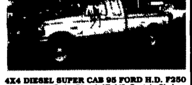
4X4 DIESEL SUPER CAB 95 FORD H.D. F250 Powerstroke Turbo Diesel, AT, A/C, Captain Chairs, Aluminum Wheels, Swing Out, Mirrors, 33,000 Miles