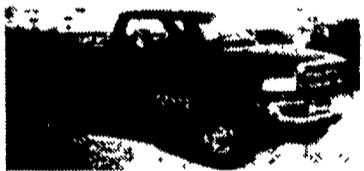
CUMMINS TURBO DIESEL 94 DODGE 2500 4x4 H.D., 5 Sp. Manual, Local 1 Owner, A/C, Tow Pkg., Chrome Wheels, 40,000 Miles