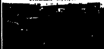
CUMMINS TURBO DIESEL 96 DODGE 2500 4x4 A Nice One, 40,000 Miles, Auto, A/C, Excellent Fuel Mileage, Very Strong Truck