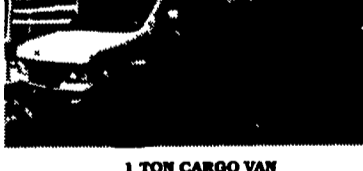
1 TON CARGO VAN 93 FORD E-350 EXTENDED LENGTH 361 F.I. V8, Auto, A/C, Very Clean