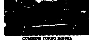
CUMMINS TURBO DIESEL 4X4 94 DODGE 2500 Awesome Diesel Power H.D. 6 sp, A/C, Tow Pkg., Low Miles, 2 Available