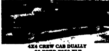
4X4 CREW CAB DUALY 88 FORD F350 XLT The nicest anywhere. 80,000 Original Miles, V8, Auto, A/C, Alloy Wheels, Tow Pkg. It's Perfect.