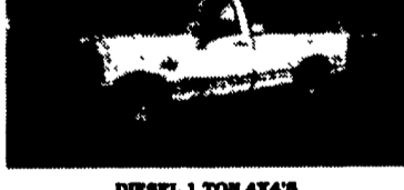
DIESEL 1 TON 4X4'S FORD F350'S Powerstroke Turbo Diesel, 5 Available, Auto & 5 sp, Call for Details