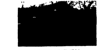
BIG DUMP 95 IH 4700 444 Turbo Diesel, 6 plus 1 Trans, Rodgers Dump & Hoist, Roll Down Tarp, 23,000 Miles