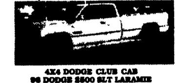
4X4 DODGE CLUB CAB 96 DODGE 2800 SLT LARAMIE Absolutely Perfect. Only 11,000 Miles. This is the Nicest Anywhere, Cummins Turbo Diesel, H.D., 6 Sp., O/D, A/C, $29,900