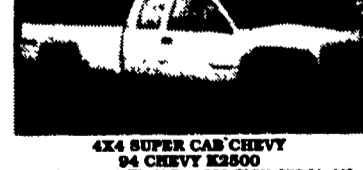
4X4 SUPER CAB CHEVY 94 CHEVY K2500 Excellent work Tk, H.D., 8800 GVW, 380 I.L., V8 - 5 sp O/D, Vinyl Seat & Floor 28,000 Miles