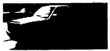
88 CHEVY K2500 4x4 3/4 Ton, 380 V8, Auto, A/C, Excellent Body & Paint $10,900