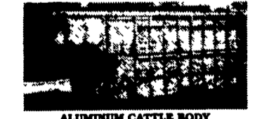
ALUMINUM CATTLE BODY Eby Quality $3,500