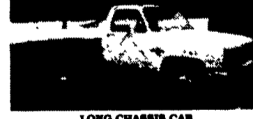
LONG CHASSIS CAB 86 CHEVY C-30 Long 161 W.B., Strong 464, V8 - 4 sp, A/C