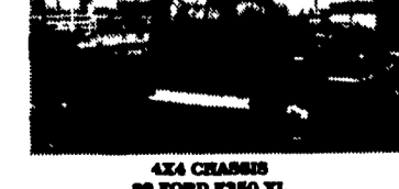
4X4 CHASSIS 89 FORD F350 XL Very Nice. Only 70,000 Miles, Fuel Inj 480, 5 sp O/D, A/C, A Real Workin Machine