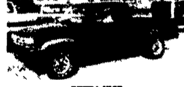
EXTRA NICE 90 FORD RANGER XLT V6, 5 sp, A/C, Perfect Body & Paint, Alloy Wheels, only 60,000 Miles