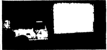
SUPER DUTY CHASSIS 96 FORD Powerstroke Turbo Diesel, Auto, Long 161 W.B., Dual tanks, only 6,000 Miles Heavy 15,000 GVW