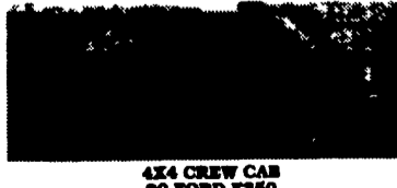
4X4 CREW CAB 90 FORD F350 Perfect for the work crew. Vinyl seat & floors, 480 I.L., AT, A/C, Trailer Tow Pkg