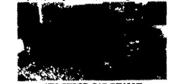
4X4 SUPER CAB DUALY 95 CHEVY K3500 Perfect. 20,000 Pampered miles 6.5 Turbo Diesel, AT, A/C, Bliverade, All Options, Chrome Wheels.