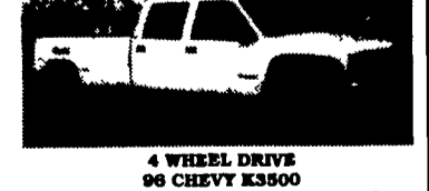
4 WHEEL DRIVE 96 CHEVY K3500 4 Door Dually, 6.5 Turbo Diesel, AT, A/C, All Options, New Tk Warranty.