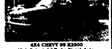
4X4 CHEVY 95 K2500 High Output, 6.5 Turbo Diesel, Auto, A/C, H.D. 3/4 Ton