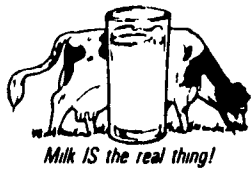
Milk IS the real thing!

FREY BROS. INC. 372 Puseyville Road Quarryville, PA, 17566