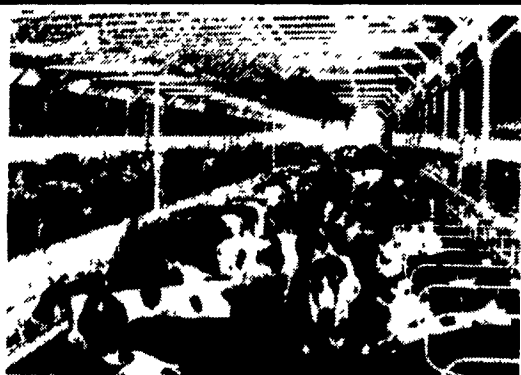
Free Stall Barn Interior