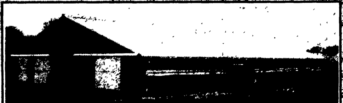
Concrete Slatted Free Stall Barn