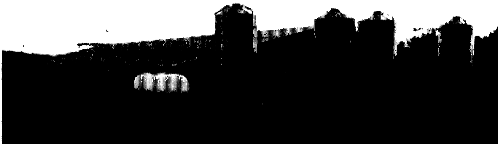
81 ft. Wide Style Finisher Building