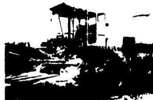
NH 2100, SN#404504, 1984, 4 RN Cornhead, 10' Hay Head, 4WD, 2500 Hrs., Like New, Rubber Excellent, One Owner $65,000