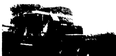
1990 MF 8460 Combine with Hillside Cleaning, 20 Ft. Floating and 6 Row Corn Head, 3219 Hrs $67,000