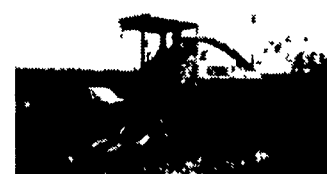
1994 Claas 690 Jaguar (SN-18809-1597) 4R Corn Head, 10 Ft. Pickup Head, Roller Mill, 4WD, Auto Pilot Self Stear, cable release hitch, 750 hours (engine: 975 Hrs.) $135,000