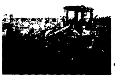
'80 45C Michigan Rebuilt 453 Detroit $18,000

391 N. Farmersville Rd., Ephrata, PA 17522 (Just minutes off RT 222) (717) 859-3283