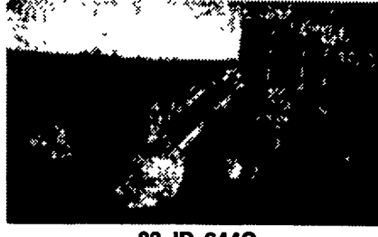
83 JD 644C $32,000