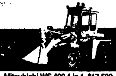
Mitsubishi WS 400 4 in 1 $17,500