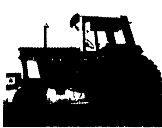
International 1086, weights, 540 1000 PTO, nice original