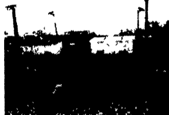
3) JD 7000 4R Planters, Dry Fertilizer, 2 Have No-Til Colters, 1 Does Not