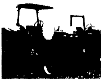
Case IH 265 offset, cultivator, side dresser, 1475 Hrs.