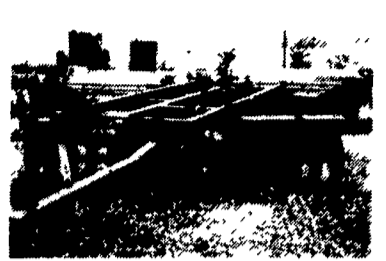
3) Miller 11' offset disks