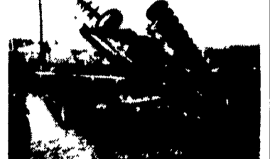
1 of 2 JD 220 18' center fold disks, 1 has rear leveling harrow