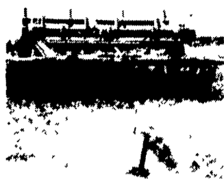
John Deere 1710 11T soil saver, cone blades, walking tandems