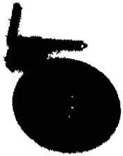
Good Used Spring Loaded Plow Colters, 1 3/8" Shank or 1 1/2"