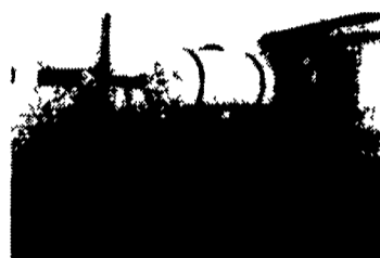
MODEL P150 WATER WHEEL PLANTER IN STOCK!!