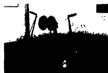
SUPER DELUXE FLATBED MULCH LAYER