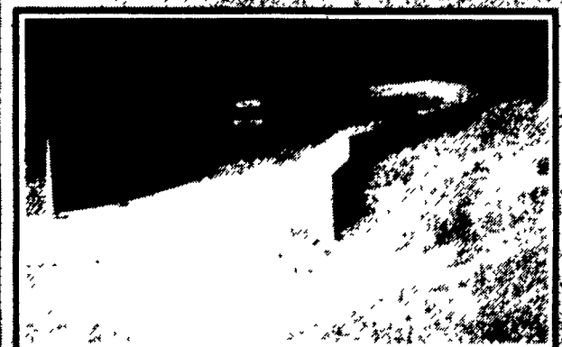
Precast Concrete Bunker Silos