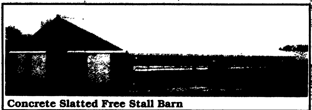
Concrete Slatted Free Stall Barn