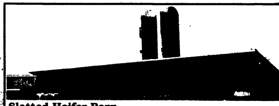
Slatted Heifer Barn