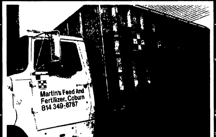
Farrell Brown is one of the drivers who delivers Purina Chows to local farmers

USDA/ARS Parsippany, NJ 07054 717-442-4100 1-800-835-9500 Unionville, PA 17225 610-247-2327