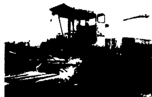
NH 2100, SN#404504, 1984, 4 RN Cornhead, 10' Hay Head, 4WD, 2500 Hrs., Like New, Rubber Excellent, One Owner $65,000