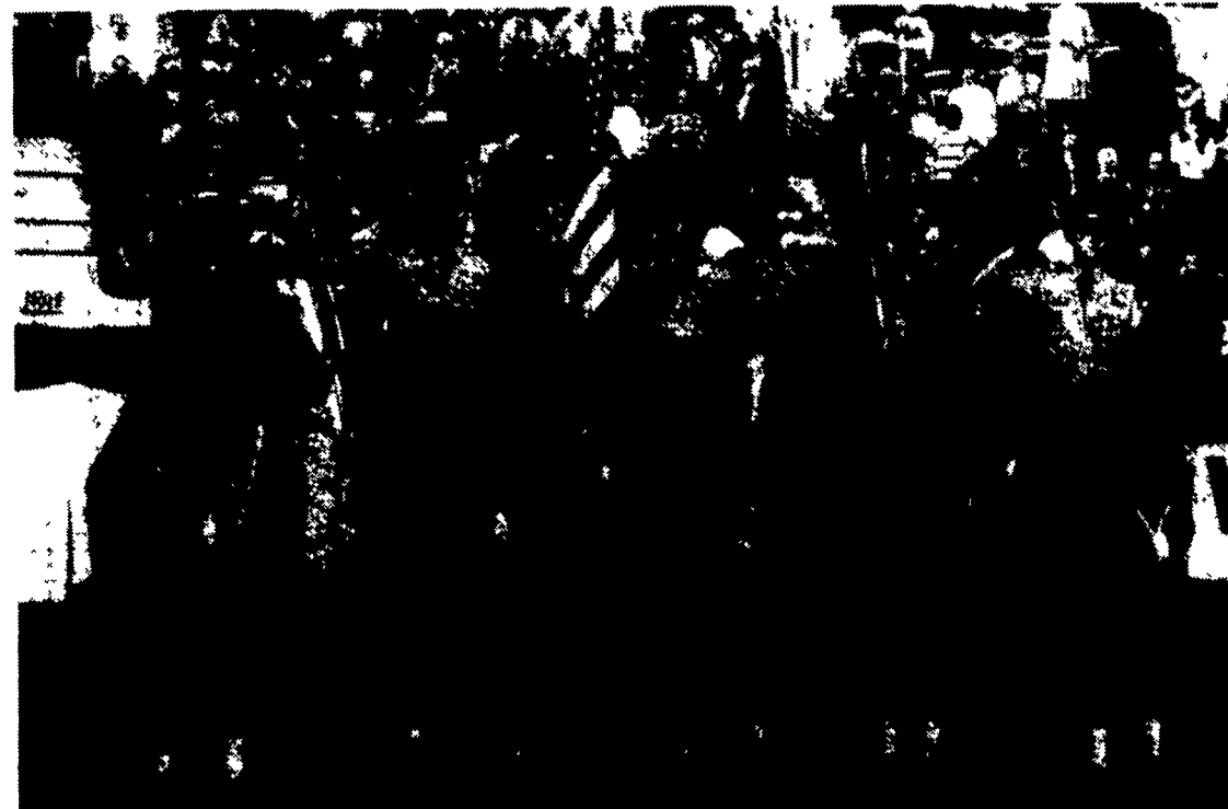
The color guard at attention during the national anthem at the opening of the Farm Show last Saturday.