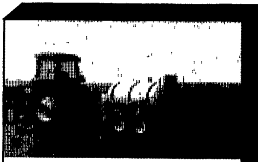
Pull-Type Sprayer, 500 Gallon Tandem & Single Axle, 45' Or 60' Boom