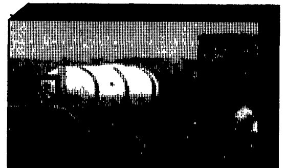
750 Gallon Or 1,000 Gallon Pull-Type w/Heavy Duty Tandem Or Single Axle, 45' Or 60' Boom