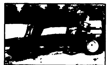
No Parking Stands

SMC's 2408 Quick Attach Loader is computer-designed to match tractors in the 15 to 35 HP range. Its unique design allows for installing most belly-mount mowers along with the loader. It's an efficient design too. 80% of the loader can